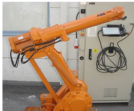
Example of Robot