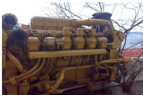
Example of Generator Set