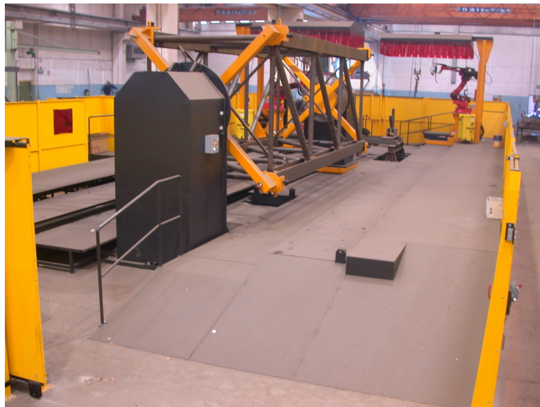
Example of Welding Machine