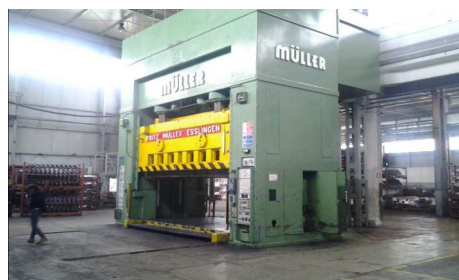
Example of Hydraulic Press