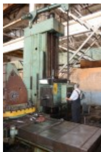
Example of Boring Machine