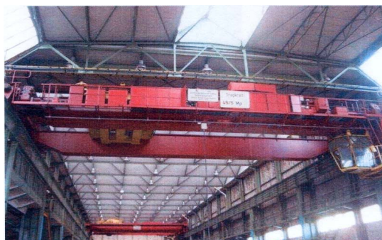
Example of Crane