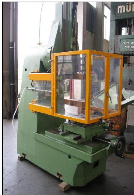
Example of Slotting Machine