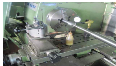
Example of Lathe CNC