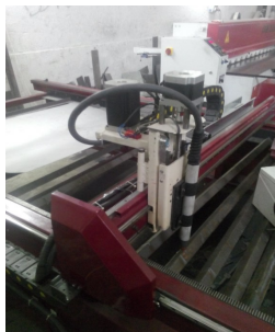
Example of Plasma Cutting Machine