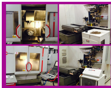
Example of Machining Center High Speed